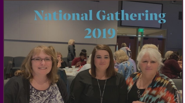
Staff enjoyed a few days in Chaska, Minnesota at the Love INC National Gathering.